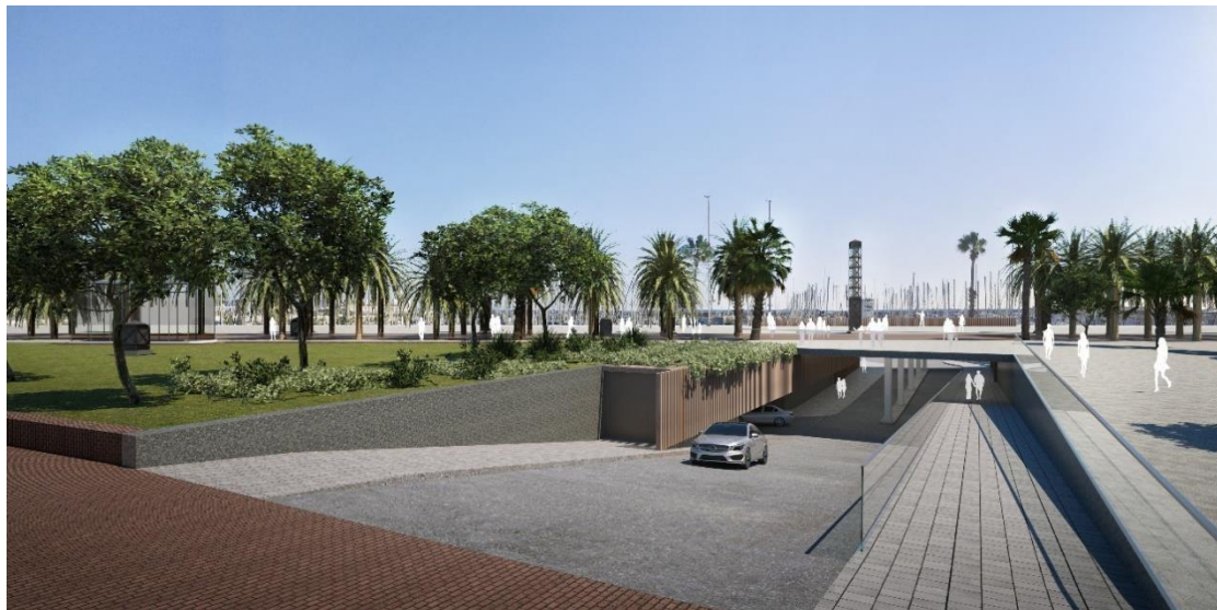
Proposed new access to the Olympic Port

Progress is also being made for the new point of access, which will connect Avinguda del Litoral with the lower level of the Mestral Wharf. The intervention will allow improvements to accessibility, permeability and the continuity of the Olympic Village neighbourhood and the Olympic Port Park, and will get rid of barriers and slopes. The drafting of the executive project has already been assigned and it is foreseen that the works will start at the end of 2021, and will finish at the start of 2023, with a total investment of 2.8 million euros.