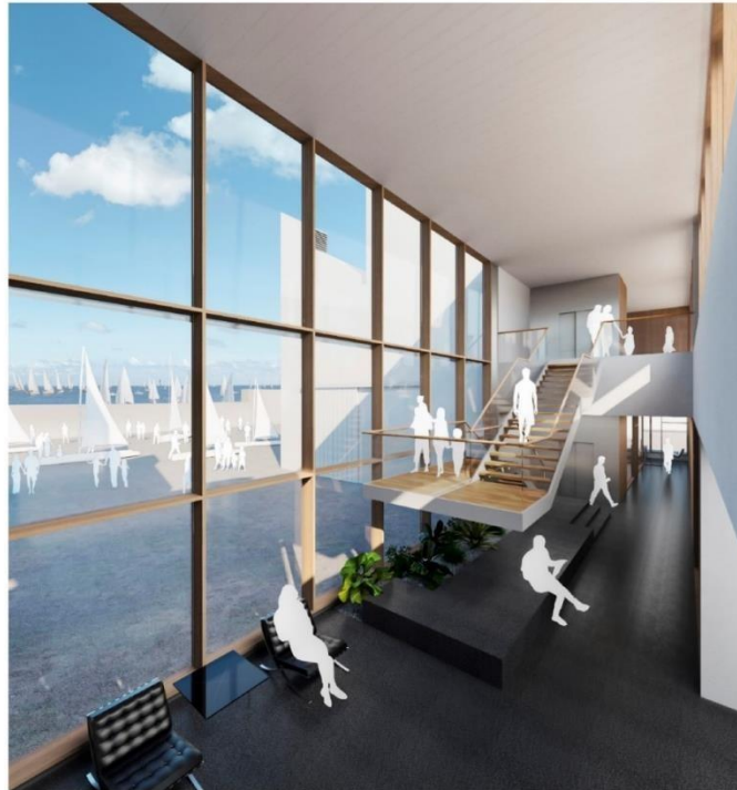
Proposed new interior of the Barcelona Municipal Sailing Centre

The boost will be a result of refurbishments to the Barcelona Municipal Sailing Centre of the Barcelona Sports Institute, which will be able to improve its services with new facilities which will be more modern and adapted, such as a gym, changing rooms, activity rooms, hangars and the rest of the necessary space for nautical sports. The total project will be a size of approximately 2,500 square metres and will cost 3.8 million euros. In the next few weeks, the drafting for the executive project will be awarded.