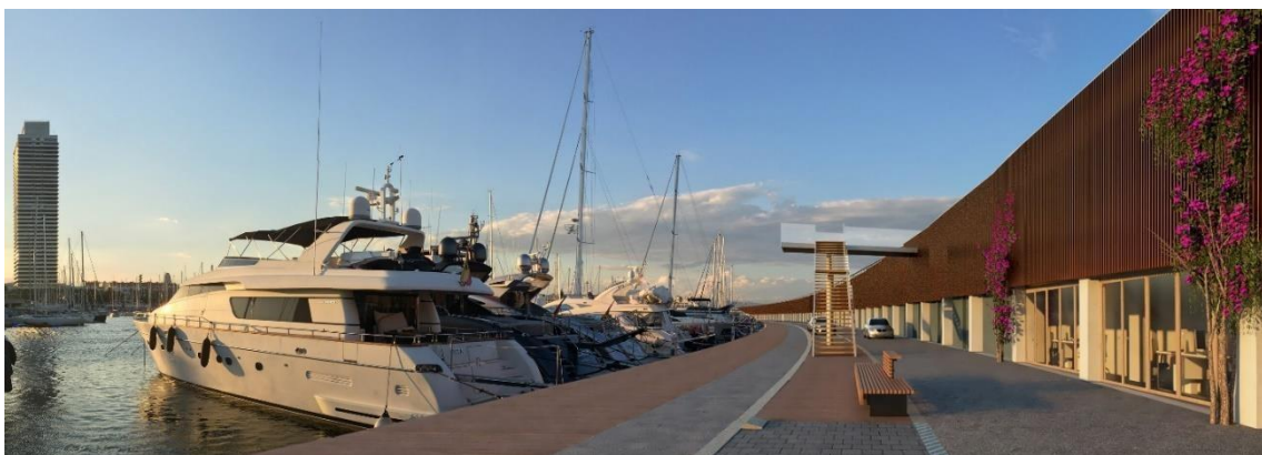
Proposed promenade with new establishments and storage facilities

On the other hand, the comprehensive regeneration project of the new establishments and storage facilities, as well as the redevelopment of the seawall space, are in the process of adjudication. This will also complement the pillar of boosting the blue economy. The rest of activity will be located in these new regenerated spaces, and the storage facilities for sailors will be located in the central part of the seawall.