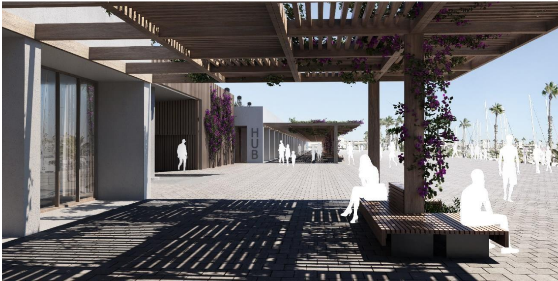
Proposed new establishments in Mestral Wharf

The tangible first step in this direction is the recovery of the spaces in the Mestral Wharf, currently occupied by nightlife, to be able to stay on schedule for the aforementioned projects. To date, 4 venues have voluntarily given up their properties, with 26 more pending. The 16 th of October was the end of the period of administrative enquiry of those 26 venues whose properties were not voluntarily given up. Now, the Barcelona City Council has opened the court proceeding, anticipating the authorisation of eviction of said venues and their indefinite recovery before the end of the year.